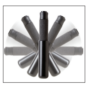
Designed for military or special operations, the rotating polymer scabbards will clip onto all modern equipment vests.

Protecting Those Who Protect ASP, INC • Box 1794 • Appleton, WI 54912 • (920) 735-6242 • asp-usa.com